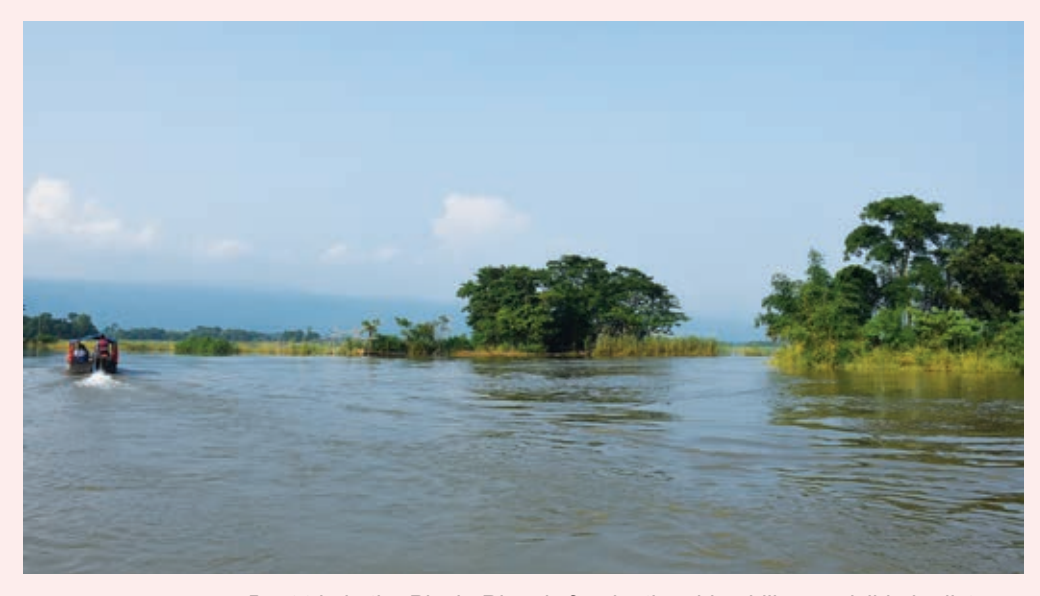
Boat trip in the Piyain River is fascinating, blue hills are visible in distance

and Piyain rivers. The Surma is a tributary of the Borak River which rises in Lusai hill of India. In the rainy season the Surma becomes flood-prone but in the dry season boat journey in the river is very comfortable. The Piyain flows close to the foot hills adjacent to Jaflong of Sylhet. It is known as the Sari River too. As the Piyain is a hilly river, the hilly stream of water comes down and flash flood occurs there. With the flood water, it carries a huge amount of stones and sand from upstream. River cruise in these rivers is delightful.