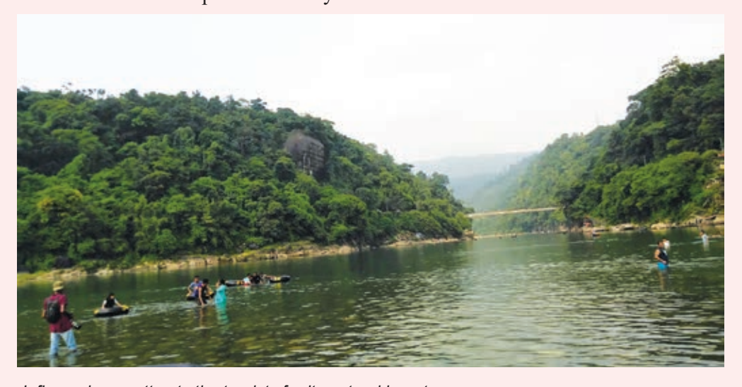
Jaflong always attracts the tourists for its natural beauty

also the high hills and the deep forest adjacent to the place just beyond the border irresistibly attracts the tourists. To enjoy such scenic beauty native and foreign tourists come to the spot round the year.