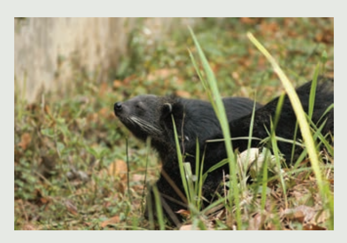
Binturongs at Bangabandhu Sheikh Mujib Safari Park, Dula Hazra, Chakaria, Cox's Bazar

feline appearance, species is often called bearcats. It is also known as Asian Bearcat or Palawan Binturong. Bangla names BanshBhaluk. includes Gachh Feuwa. GechhoBholluk Bhamakar Bholluk. This rare and Vulnerablenocturnal mammal is the inhabitant of denser parts of mixed forests evergreen bamboo clumps in the southeast (Chottogram