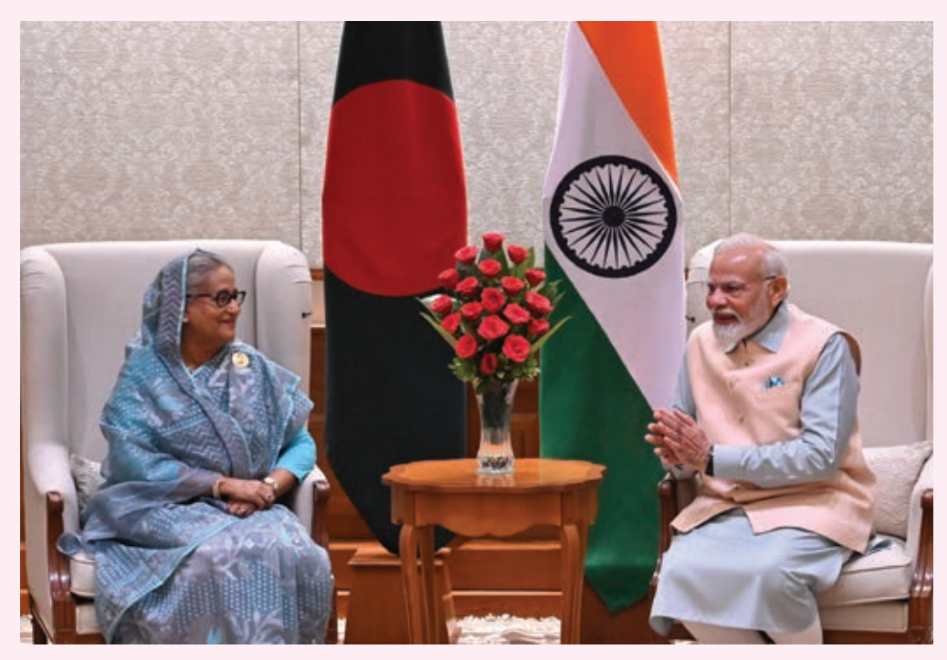
Bangladesh Prime Minister Sheikh Hasina meets with her Indian counterpart Narendra Modi at latter's official residence in New Delhi on September 8

Connectivity, commercial linkage and bilateral ties dominated discussions between Prime Minister Sheikh Hasina and Indian Prime Minister Narendra Modi in Delhi on September 8, at a time when both face polls ahead.