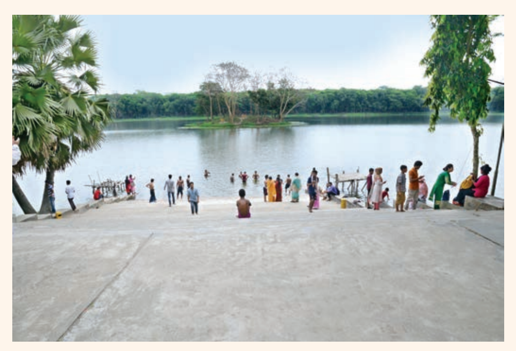
Tourists at Durgashagor Dighi

the tourists to visit the place, the lonely ambience of the bank of the Dighi attracts the tourists in other seasons of the year too.