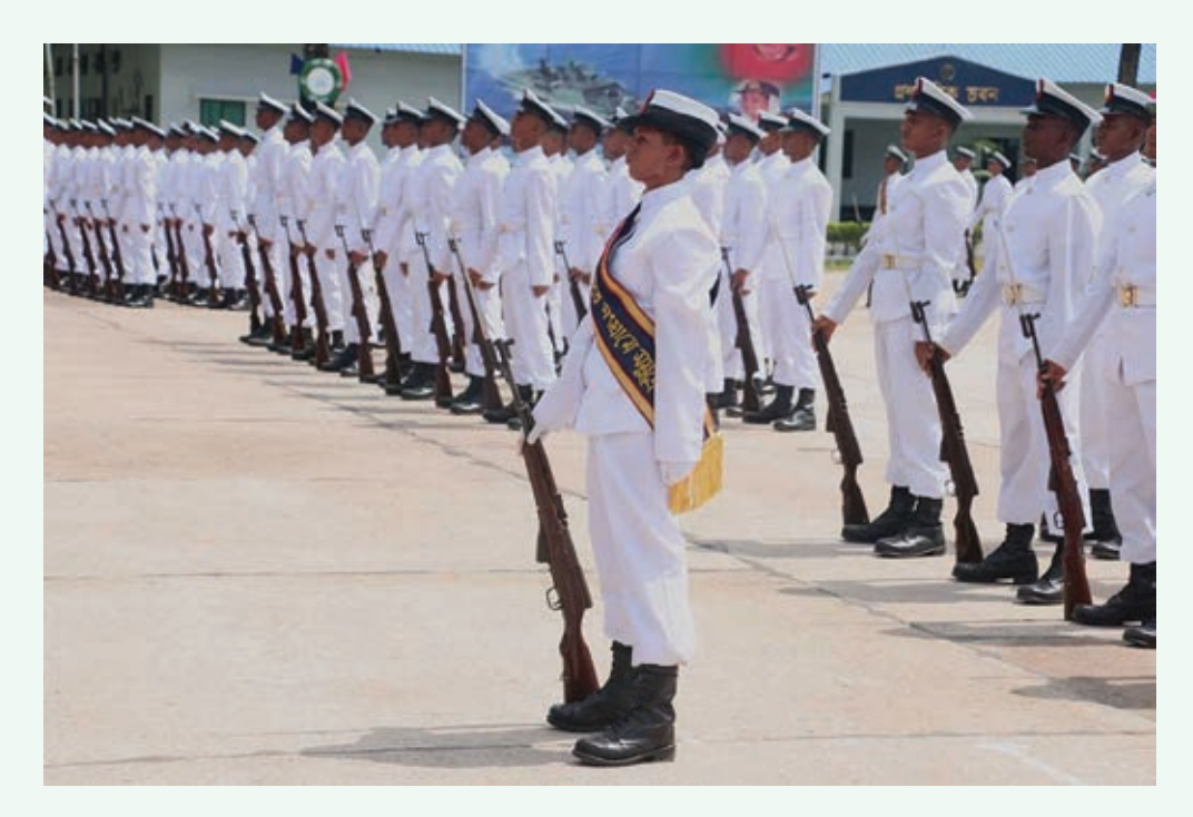
Women in Bangladesh Navy

given appropriate treatment and opportunity in such spheres of life where they are appropriate and fit best. The relation between men and women should not be unduly competitive, rather it should be complementary. In no way it should appear conflicting. It must be cooperative as a matter of policy and principle.