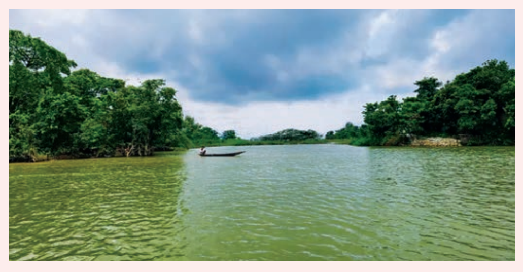
The Surma, one of the major rivers with strong currents in the country

Apart from the above spots a tourist may like to go for river cruise in the Surma