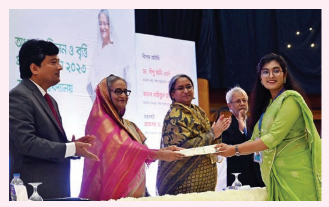
Prime Minister Sheikh Hasina handing over scholarship to 10 insolvent but meritorious students of the national council of principals of the colleges affiliated under the National University at a function at the Bangabandhu International Conference Centre in the city on July 16