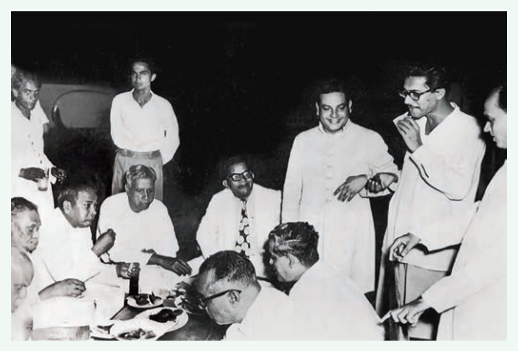
Meeting of the Jukto Front (United Front) for selecting the candidates prior to election, December 1953

6 points demand in 1966 ushered in Bengali nationalism.