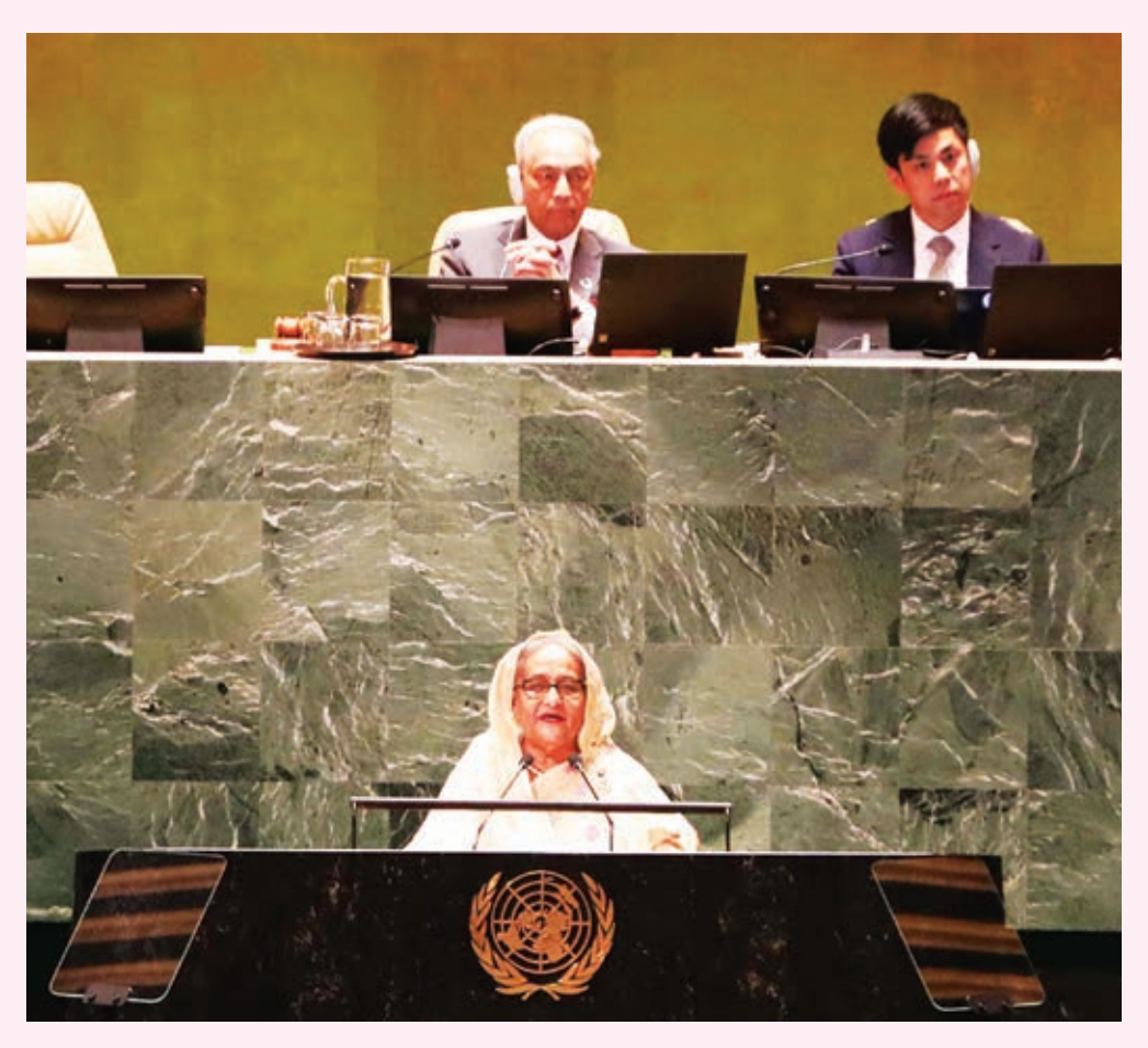
Prime Minister Sheikh Hasina addressing the 78th session of the United Nations General Assembly (UNGA) at the General Assembly Hall in New York on September 22

She said the overall progress towards a peaceful and prosperous common future is faced with threats due to the impacts of the pandemic, the effects of an existential climate crisis, and the wide ramifications of the war in Ukraine affecting global food, financial, and energy securities have greatly impeded the achievement of SDGs in developing countries.