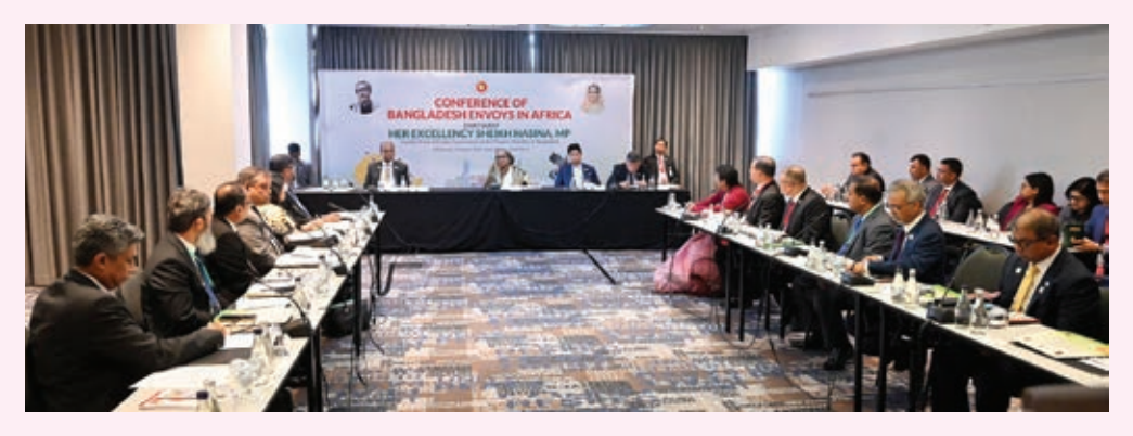
Prime Minister Sheikh Hasina speaks at the 'Conference of Bangladesh Envoys in Africa' organised by Bangladesh ambassadors stationed in African countries at Radisson Blu Hotel Sandton in Johannesburg on August 22

The Prime Minister was speaking at the Bangladesh Trade & Business Summit in South Africa jointly organised by Bangladesh Securities and Exchange Commission (BSEC) and Bangladesh Investment Development Authority (BIDA) at the Radisson Blu Hotel and Convention Center. Source: The Financial Express