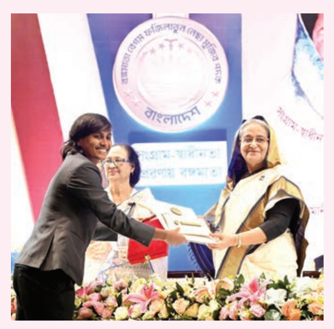
Prime Minister Sheikh Hasina hands over the 'Bangamata Begum Fazilatunnesa Mujib Padak-2023' at a ceremony at Osmani Memorial Auditorium in the city on August 8

Mujib had a significant contribution to the independence of the country and all achievements during the struggle for liberation.