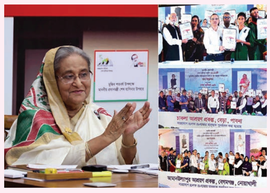
Prime Minister Sheikh Hasina declares 12 more districts and 123 upazilas homeless & landlessfree through video conferencing from her official residence Ganobhaban in Dhaka on August 9

Noakhali district. Source: The Financial Express