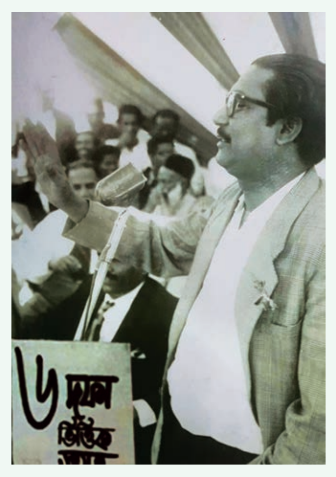
Sheikh Mujibur Rahman announces the six-point in Lahore, 5 February 1966

Bengalis which can be compared to the height of the Himalayas and the magnitude and depth of the epic. Bangabandhu is the creator of the new history of Bengalis, the great hero.