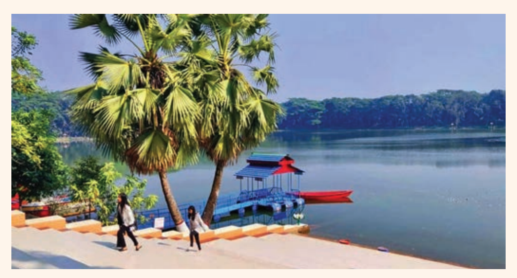
Ghat (Landing stairs) of the pond

Local people also call it as Madhabpasha Dighi. It is the largest pond of the southern Bangladesh. Everyday hundreds of local and regional tourists visit the site to enjoy the unique greenery, serenity and have deep breaths over there. The water of the large pond is blue and it dances with the high wind. This beautiful spot attracts tourists round the years irrespective of seasons. There are also angling facilities. Anglers can catch fish twice in a year.