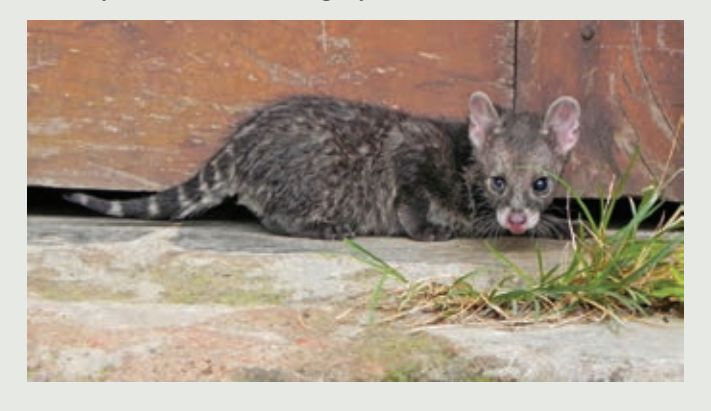
A pregnant Large Indian Civet at Bangabandhu Sheikh Mujibur Rahman Agricultural University campus, Gazipur

The nocturnal and terrestrial mammals occurs solitary. It spends most of its time on the ground, mainly in grasslands, scrubs,