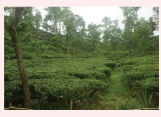
Malnichhara tea garden near Parjatan motel

Sylhet is famous for its tea estates. There are 135 tea gardens in Sylhet division out of 164 throughout the country. Malnichhara the first tea garden of the subcontinent lies close to the Airport Road which is a little distance away from Sylhet township. It is the biggest and oldest tea garden which was created in 1854. There is an