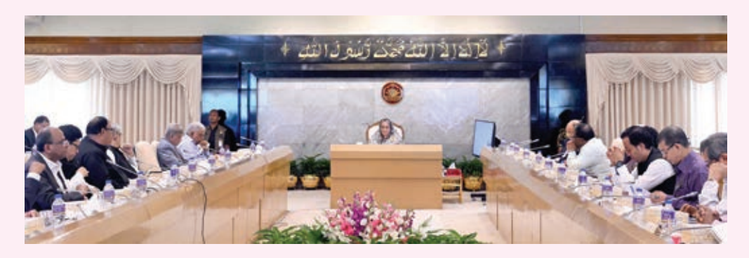
Prime Minister Sheikh Hasina presided over the meeting `Smart Bangladesh Task Force' at her office on August 3