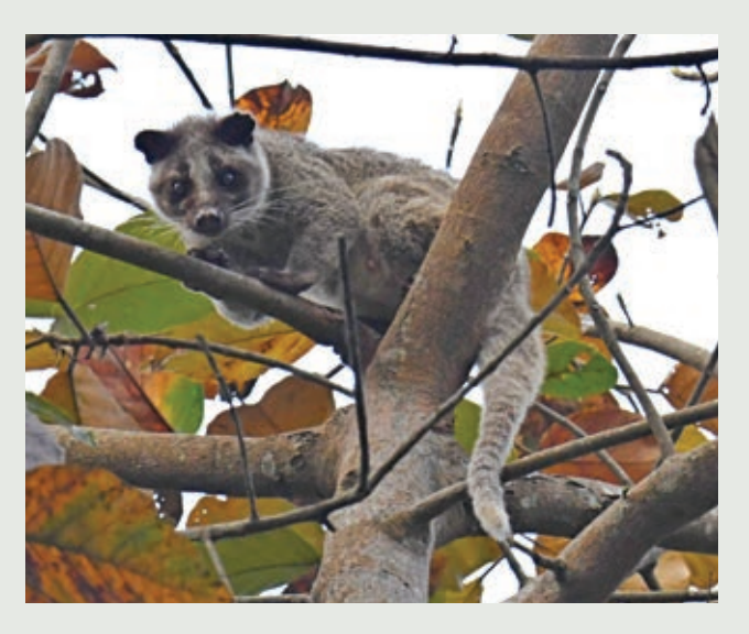
A Masked Palm Civet at Satchhari National Park, Habiganj

Indonesia, Lao PDR, Malaysia, Myanmar, Nepal, Thailand and Viet Nam.