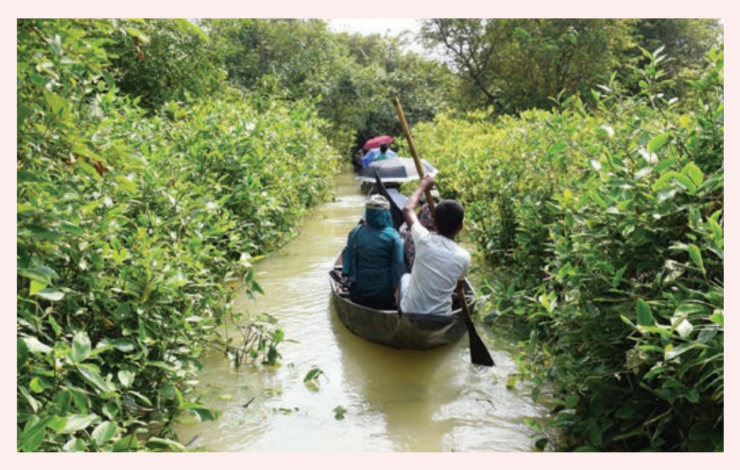
Passing through the bushes in Ratargul is thrilling

Ratargul is the sole swamp forest in the country. It is known as the Sundarbans of Sylhet. This swamp forest which has an area about 505 acres of land is surrounded by a river and a haor and is situated in the village Ratargul in Fatepur Union under Gawainghat Upazila. In this forest mostly three species of trees grow-