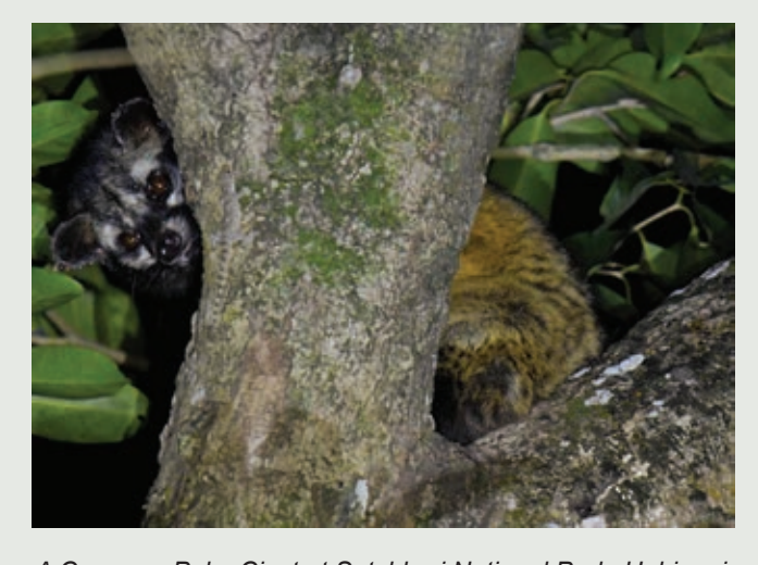
A Common Palm Civet at Satchhari National Park, Habiganj

Palm Civetor Toddy Cat. Bangla name includes Tal Khatash, Gondhogokul, Shairel, Nongor, Vondor, HaillaandTaliBiral. This common and Least Concerncivet species is the jewel of the rural forest and is widely distributed all over the country including the Sundarbans having land connection. It is known to live in human settlements including the capital city of Dhaka. Outside Bangladesh also fund in