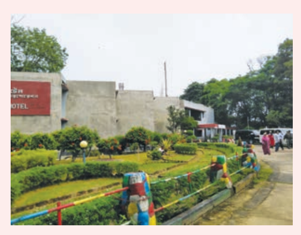
Parjatan Motel, Sylhet is located on the top of a hillock surrounded by breathtaking natural beauty

In the midst of the pleasant views, there is a motel on the top of a hillock covering an area of 40 acres of land which is 90 feet high above the ground level. It is located on the Sylhet Osmani International Airport road adjacent to the Sylhet Cadet College. The specious motel has 26 rooms, auditorium, a large dining and a ice cream parlour. Besides there is a children's amusement park-Sylhet Adventure World near the motel. It was constructed on the initiatives of the expatriates