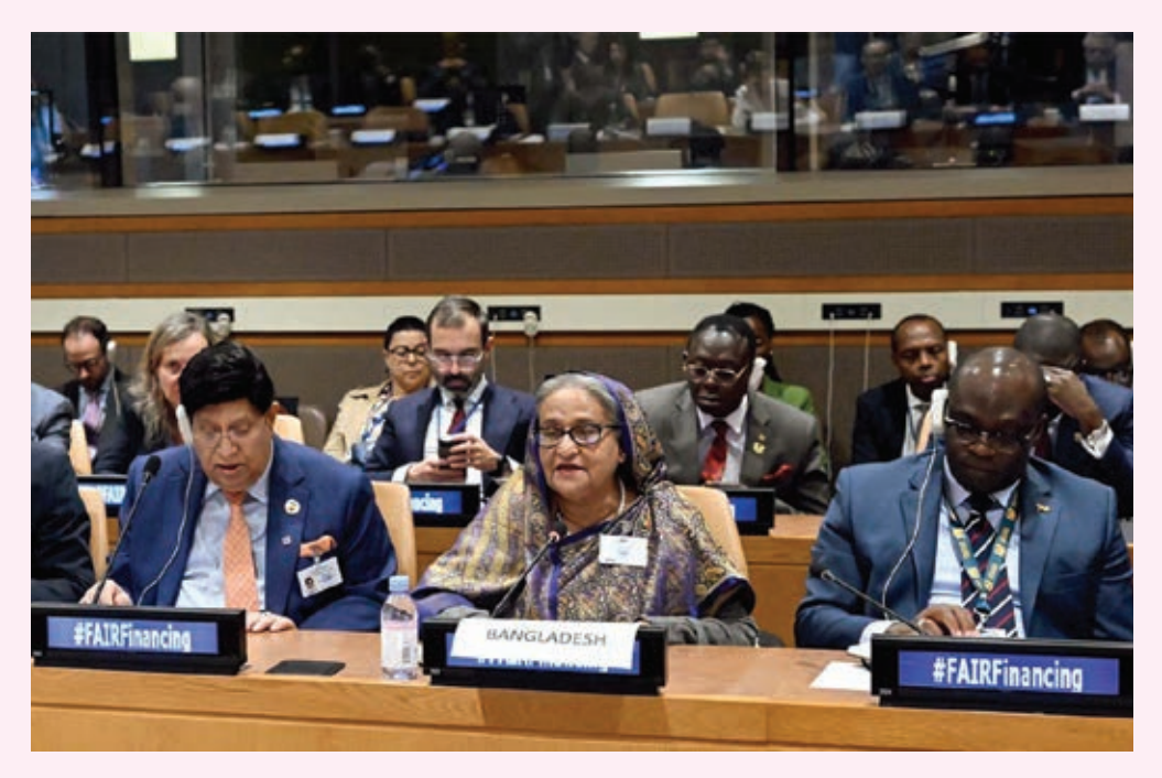
Prime Minister Sheikh Hasina speaking at the high-level roundtable meeting titled 'Towards a Fair International Financial Architecture' held at UN Headquarters in New York on September 19

First, MDBs, IFIs, and private lending agencies must re-align their priorities and mobilize additional funds for SDG implementation and climate action.