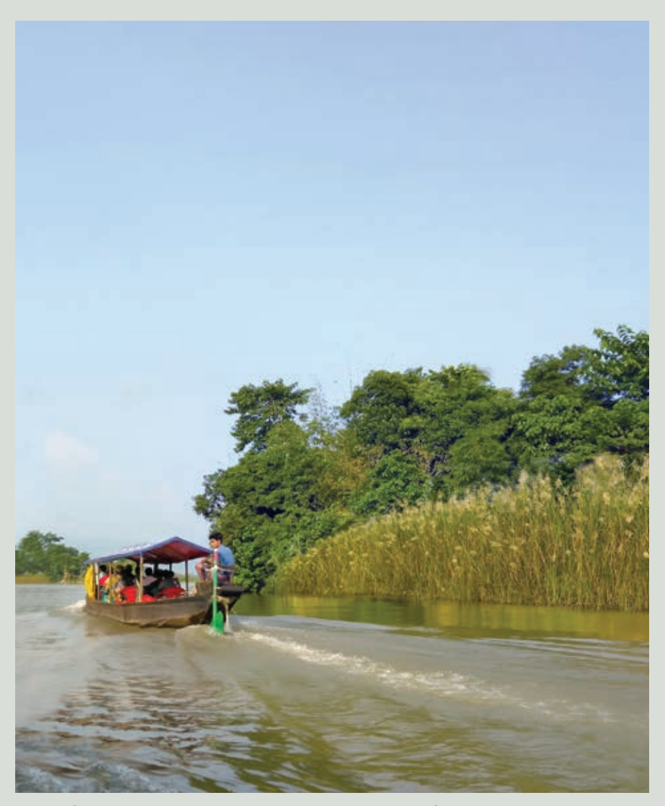
Kashful (Saccharum spontaneum) on the bank of Piyain River in Autumn