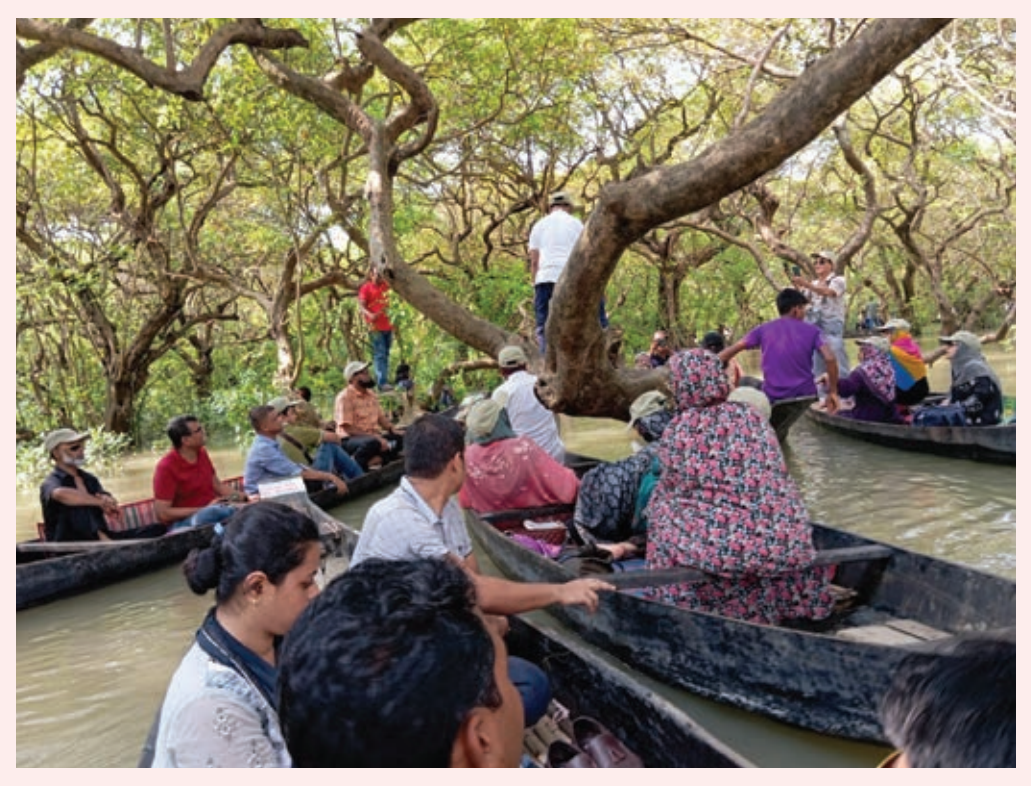
Tourists enjoying the beauty in Ratargul

Hijal, Koroch and Patibet. In addition, Boron, Bet, Ikra, Khagra, Murta and deep tall grass have made the swamp forest unique and matchless. With 73 species of plants, 25 species of mammals, 20 species of reptiles, 175 species of birds, and 9 species of amphibians live in the forest. Surrounded by thick bushes and trees in a vast body of water, this place has an extraordinary beauty. Traveling by small boats in such a calm and quiet environment is really thrilling. Any tourist would love to visit Ratargul wetlands. The best time to visit this place is monsoon. At that time, the spread of water is high and the trees are submerged up to their necks. One should not miss this place when visiting Sylhet.