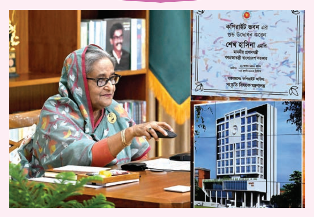
Prime Minister Sheikh Hasina inaugurated on July 4 the Copyright Bhaban virtually joining from her official residence Ganobhaban a function organised by the Cultural Affairs Ministry at the Bangladesh National Museum at Shahbagh in the city