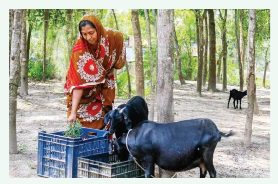
Goat rearing has empowered rural women economically

society and national life. In fact, government has already enacted laws, etc., and undertaken plan projects and programmes to achieve these objectives.