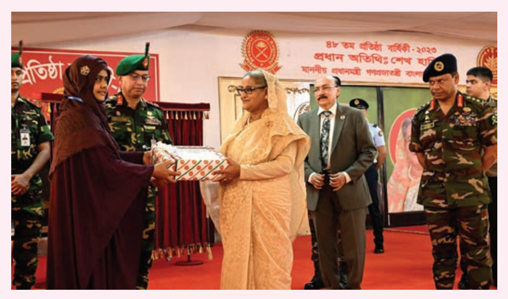
Prime Minister Sheikh Hasina handed over gifts to the family members of PGR as she attended the 48th founding anniversary programme of the President Guard Regiment (PGR) at its headquarters in Dhaka Cantonment on July 5