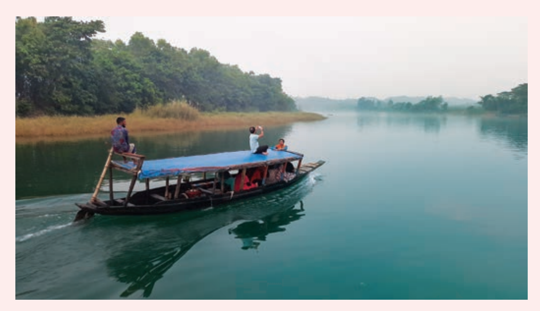
Bluish-green water changes its colour with the change of daylight in Lalakhal