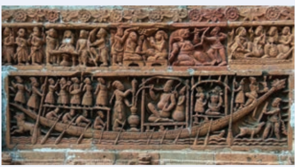
Examples of early type of boats common in ancient Bangla in 9th (left) and 18th (right) century manifested in terracotta plaques found at Paharpur Buddhist Vihara (Naogaon) and Kantajeu Temple (Dinajpur) respectively