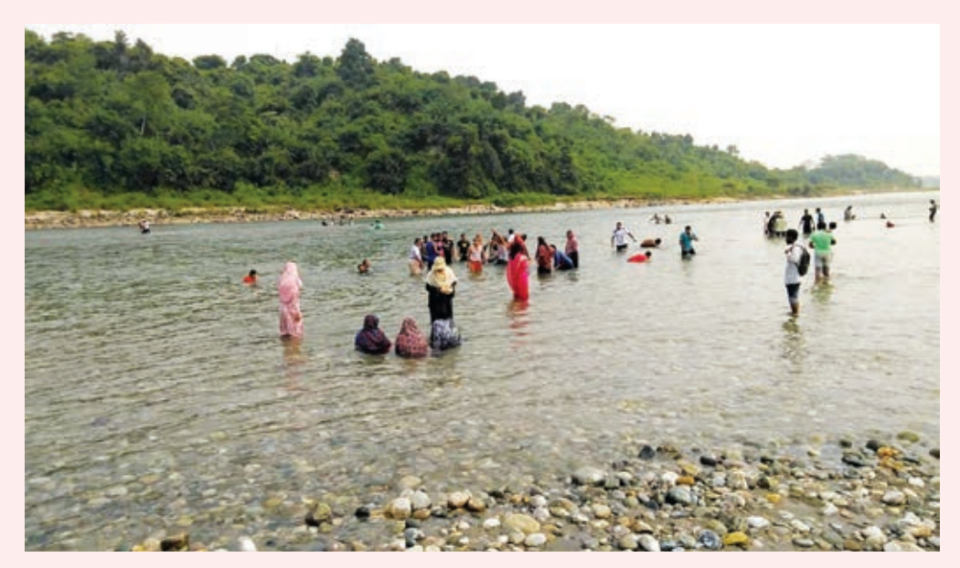
Tourists bathing in the crystal clear water of the river at Sada Pathor