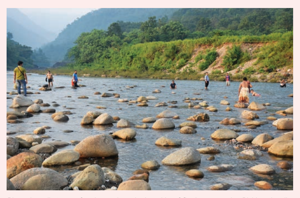
Big and small stones of various colours in the midst of flowing water give Bichhanakandi a unique beauty

branch of Piyain River passes under the hill towards Bholaganj. The continuous flow of water and the beauty of extensive green hills can easily bring tranquility at heart of a tourist. The scope for pleasure trip by boat is available here. Hills, rivers, fountains and rocks- altogether, this Bichnakandi is a playground of natural beauty.