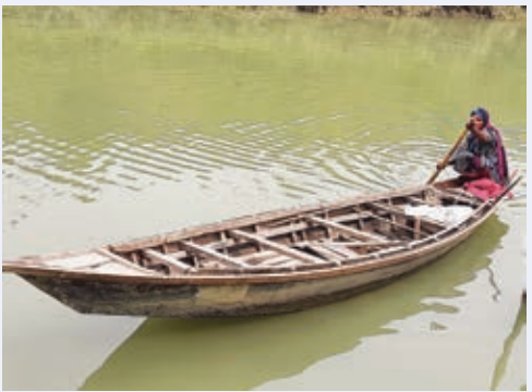
Pansi boat Dingi boat

Jhiori-Naiori Nao: It was a kind of smaller row-boat, being not more than 2m - 2.5 in length with breadth of 1m at the mid-part covered by such a half barrel shaped wicker shed so that it could accommodate the jhiori-naiori i.e. married women like guest going to or returning from paternal home. Earlier the boatman would use sail to ply it while on the river route. But it was suitable for plying in the khal i.e. local water-channel only. It was of two kinds, i.e. ekmallai (one boatman) and domallai (two boatmen) depending on the size of a boat as well as number of passengers. Howsoever, it is also called Baidya Nao in case of its use by the gypsy families for dwelling purpose. The Baidyas belong to such a petty landless ethnic group who earn their livelihood chiefly by snake charming and wanders one anchorage to another in sub-groups. Each family use a nao/nauka (boat) to survive on.