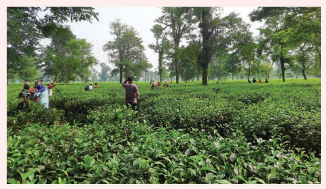
Tea garden covering an area of 2,750 acres in the plain land at the end of Khasia Punji in Jaflong

orange orchard on one side of the garden. After crossing a little distance ahead of it, Rakhatua Tea Garden is there. Beside these, there are Burjan Tea Garden, Khadimnagar Tea Garden, Alibahar Tea Garden, Star Tea Garden, Daliya Tea Garden, and along with these there are some other tea gardens that lie in Sylhet. Lakkatura Tea Garden is near Sylhet town. It is one of the largest tea gardens of the district. The beauty of these tea gardens wrapped in a green carpet on the steps of hillocks will fascinate anyone.