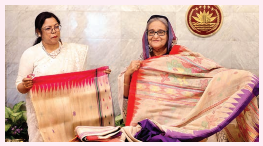
Holding a Kolaboti saree made from banana plant fibre, Prime Minister Sheikh Hasina poses for a photograph at the cabinet room of the Prime Minister's Office on July 17

Prime Minister Sheikh Hasina July 17 received Kolaboti sarees and handicrafts, all made from banana plant fibre.