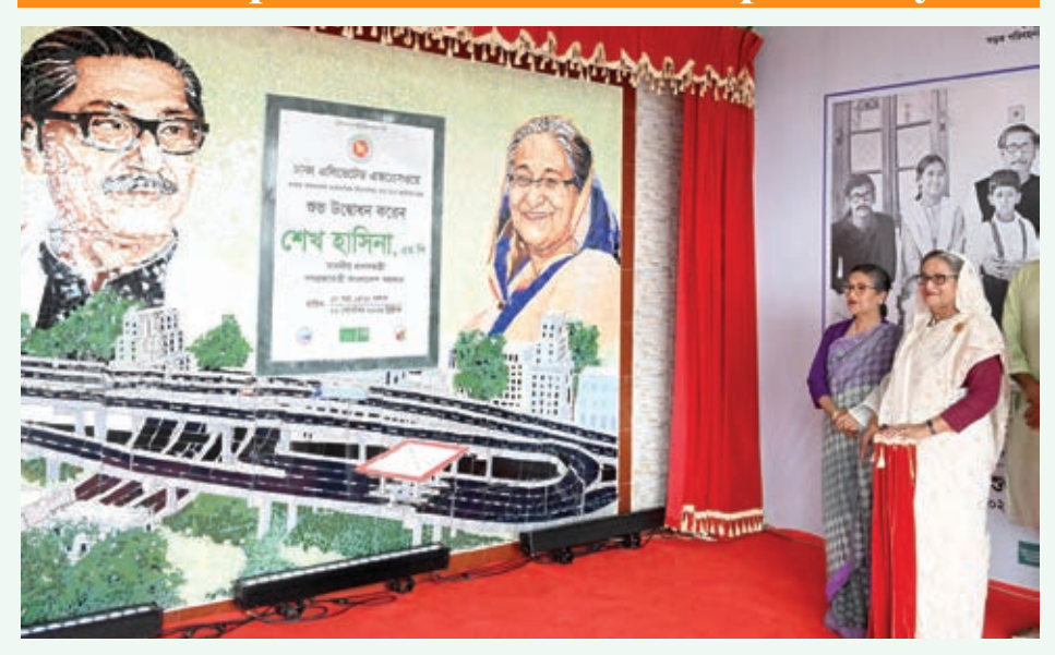
Prime Minister Sheikh Hasina inaugurates the 11.5 km Airport-Farmgate segment of 19.73 km Dhaka Elevated Expressway, the first of its kind in the country, on September 2

Prime Minister Sheikh Hasina on September 2 inaugurated the 11.5 km Airport-Farmgate segment of 19.73 km Dhaka Elevated Expressway, the first of its kind in the country, raising high hope to reduce traffic congestion and commuters' travel time in the capital.