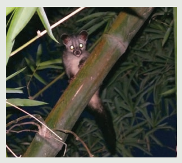
A juvenile Common Palm Civet in the bamboo thicket at Shatsoiya village, Fakirhat, Bagerhat

Bhutan, Borneo, Cambodia, China, India, Lao PDR, Myanmar, Nepal, Peninsular Malaysia, Philippines, Singapore, Sri Lanka, Thailand and Viet Nam.