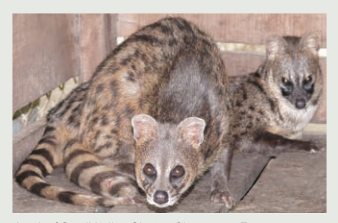
A pair of Small Indian Civet at Chattogram Zoo

spends sleeping in burrows, tree holes and thickets, in abandoned brickfields. disused buildings ruins, but sometimes may become active in the day. It is mainly omnivorous; eats snakes, rats, mice, birds, poultry, fruits, roots, insects, carrion etc. The civet marks its territory the characteristic scent secreted from the civet gland. It is usually a silent animal.