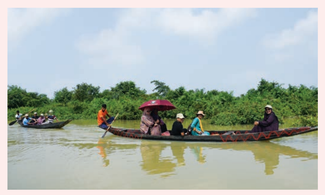
Tourists going twards Ratargul swamp forest by boat