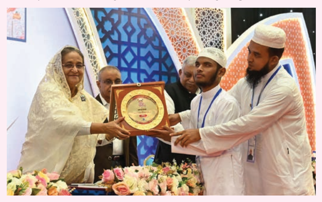
Prime Minister Sheikh Hasina hands over an award to a winner of National Hifzul Quran Competition 2023 at Bangabandhu International Conference Centre in Dhaka on August 13

Prime Minister Sheikh Hasina on August 13 urged the country's alem-uleama to cooperate with her government to eradicate religious superstitions, terrorism and militancy so no one can misguide the children by wrong interpretation of Islam.