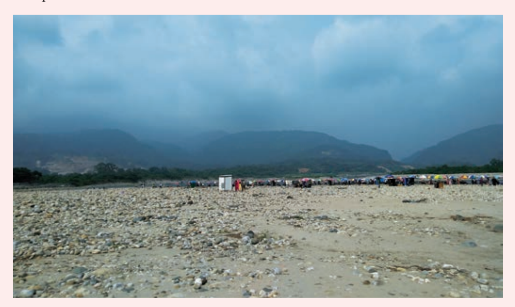
White stones scattered accross the river bank at Bholagani Sada Pathor

Bholaganj Sada Pathor is about 35 km away from Sylhet town. It is located in Companiganj Upazila on the border of Sylhet district and near East Khasia Hills in Meghalaya state of India. Cherrapunji and Shillong of India are on the other side of the hill. This place is known as Bholaganj zero point. Bholaganj is famous for its white stones of various shapes, crystal clear water and adjacent green hills. Bholaganj is the largest stone quarry in the country. The Dhalai River flows down the place. Along with the water of the Dhalai River, a lot of rocks and stones come down from the Khasia Jaintia Hills. The Dhalai River enters the Bangladesh and is divided into two parts, turns around and joins again. A huge number of white stones have added an extra ordinary beauty to Bholaganj. The crystal clear cool water, the white stones, reflection of the shade of green hill on the surface of water, adjacent high and low hills- altogether the beauty of Bholaganj is matchless. The visitors can enjoy swimming, floating, bathing or simply soaking their feet in the transparent and cool water.