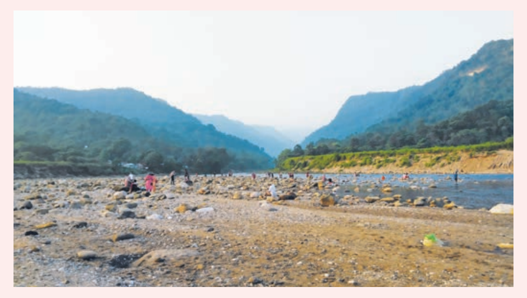
Blue hills beyond the Bichhanakandi

branch of Piyain River passes under the hill towards Bholaganj. The continuous flow of water and the beauty of extensive green hills can easily bring tranquility at heart of a tourist. The scope for pleasure trip by boat is available here. Hills, rivers, fountains and rocks- altogether, this Bichnakandi is a playground of natural beauty.