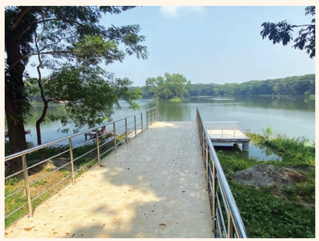
Entrance of Durgasagar Dighi

The total area of the pond is 62 acres. Around the pond, in all, there is 1.6 kilometer (1 mile) long walking track. In winter many migratory birds flock there. At that time this place starts resounding with the twittering and chirping of birds that soothe the weary tourists come from far-flung. Though this is the proper time for